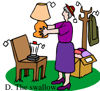
D. The swallow